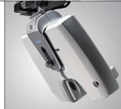
Tilttable Refractor Body

Slimmer design even prevents minimum mechanical interference during exam and enables easy monitoring over patients.