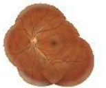
Panoramic (Non-Mydriatic Composite Retinal) Image

The function provides major information to general evaluation for eyes since users can acquire high resolution images minimizing distortion.