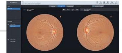
Web Browsing System

The Enhanced Visualization Technology (EVT) of HFC-1 helps to acquire high-quality images in any clinical cases. Therefore, it is specifically utilitious when capturing fine pathological variation.